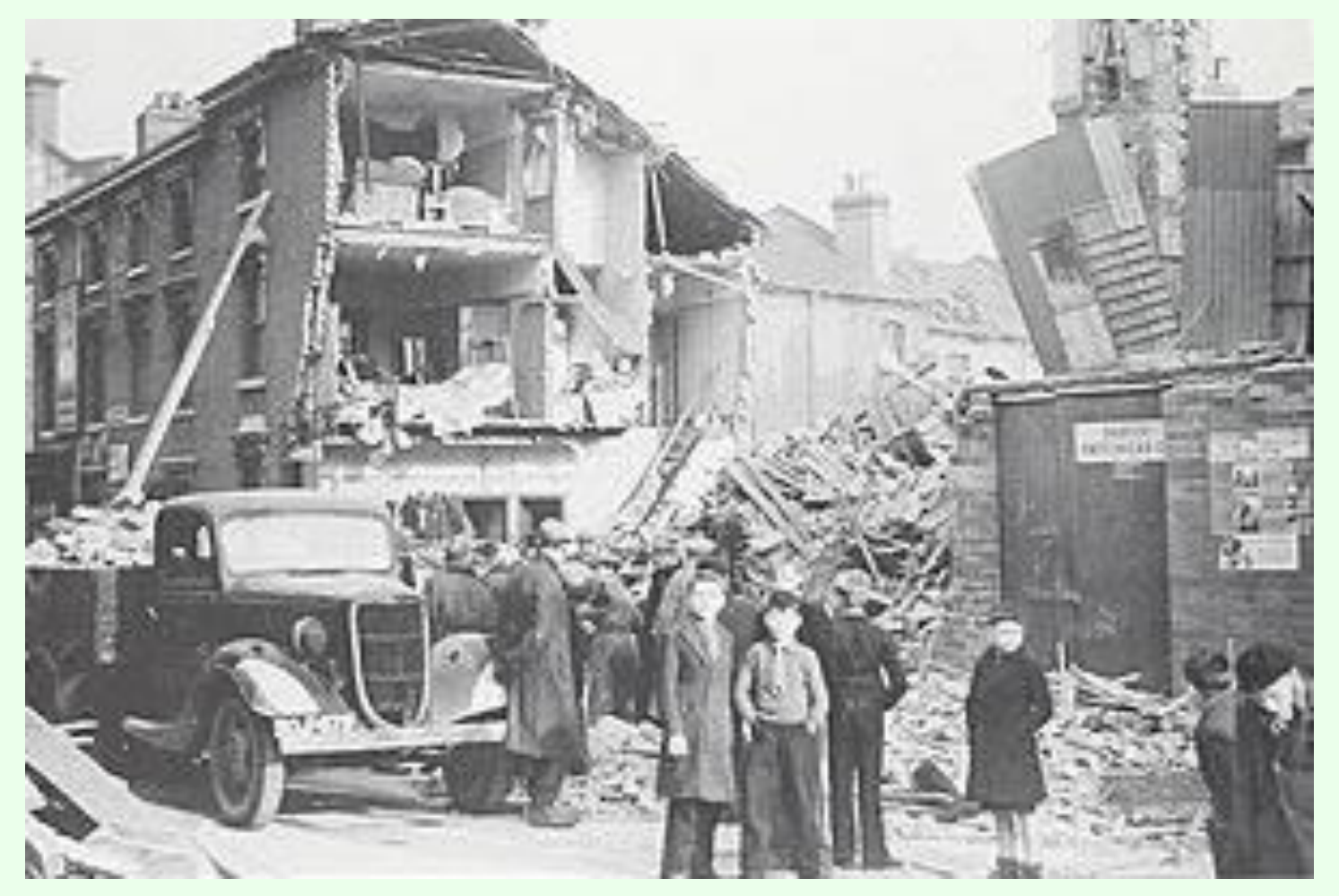
World War 2 started in 1939. Children that lived in cities were in constant danger of bombs.